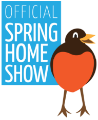
Exhibit Booth Contract Official Spring Home Show

February 24-26, 2012 PEORIA CIVIC CENTER